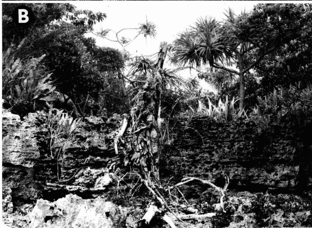
Figure 2. A. View toward the southwest from the edge of the lateritic high plain of the Ile des Pins, showing expanse of lowland forest on coraline pavement and a stand of Araucaria columnaris . B. Raised coraline pavement at coast, 1 km north of Gite Kodjeue, with Pandanus sp. The coral provides the foundation for nearly all of the lowland forest of the Ile des Pins. Interstices in the coral provide retreat sites for Cryptoblepharus novaecaledonicus and Laticauda colubrina .