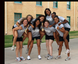
What I Really Do