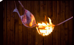
What History Books Say I Do