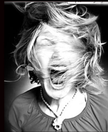
What People Want To Think I Do