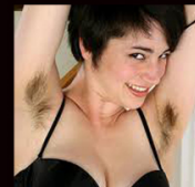
What My Parents Think I do