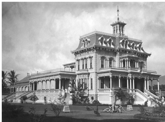
Honolulu High School, formerly Princess Ruth Ke'elikolani's residence, Hale Keoua

As the second extension lecturer in Hawai'i, Dewey agreed to give two sets of five lectures over a period of five weeks from August 15 to September 15. The lectures were to be given at eight o'clock on Tuesday and Friday evenings. The first series would be on the Life of the Child; the second, on Movements in Nineteenth Century Thought. In an effort to circulate Dewey's ideas more widely, the lectures were summarized in the Pacific Commercial Advertiser , one of the major Honolulu newspapers. 14 In addition, Dewey, in order to prepare his audience for his lectures, provided a synopsis of each talk along with a set of questions and exercises. These synopses provided a preview of the talk and were usually published on the same day that the talk was delivered. The summaries, taken from notes written up by an attendee, were published on the day following the talk.