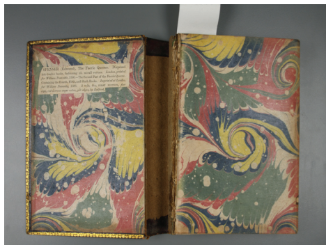
Before treatment: Detached pages and boards