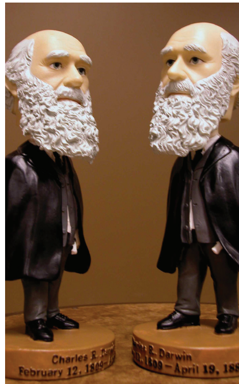
Darwin Bobblehead available in the Library Shop