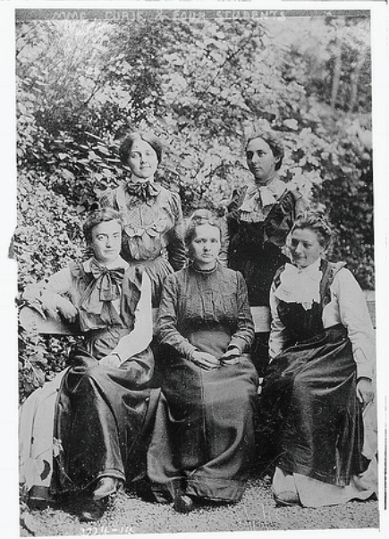
Mme. Curie & students

Google is pretty much a household name these days — with the ubiquitous search engine, maps, email and so on, everyone has probably had some type of encounter with a Google product. Yet some may have overlooked a very interesting addition to the Google oeuvre .