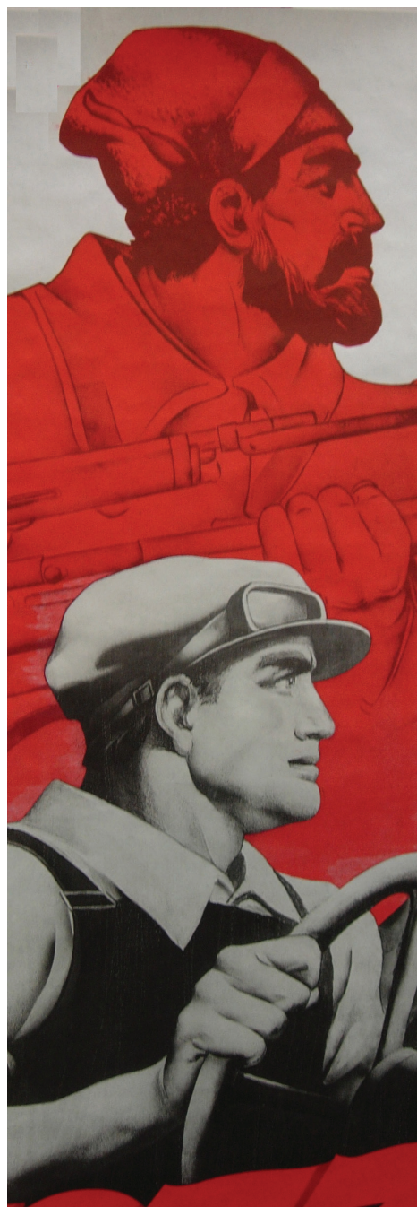
60th Anniversary of Russian Revolution

Charles Darwin changed the world; specifically, the way we look at the world. Before Darwin, everything in the natural world was considered static and unchanging. His journey around the world provided Darwin with strong evidence to the contrary: that species develop and change over time. He felt so strongly about this that he devoted over twenty years of his life to developing his theory of evolution by natural selection – a theory so sound, that it still serves as the foundation for evolutionary theory today. This exhibit has four sections about Charles Darwin's life and work: 1) Section One: is a timeline with a few major points in Darwin's life. 2) Section Two focuses on Darwin's seminal work, Origin of Species . 3) Section Three goes into more detail about the book's central concept, natural selection. 4) Section Four features important quotes about Darwin from some of today's great scientists.