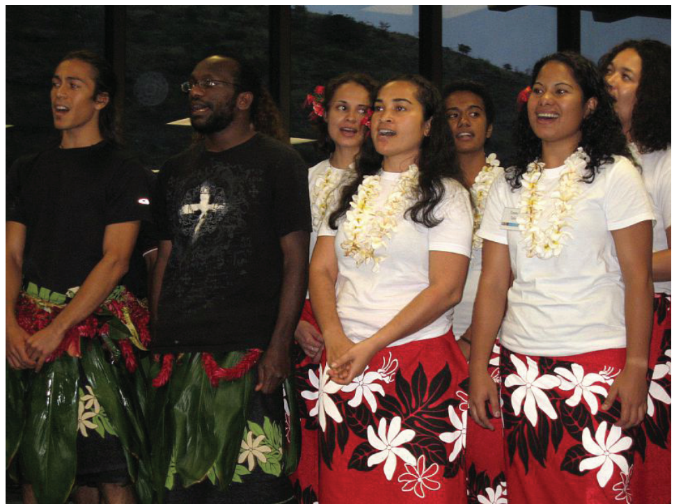
Students of the Pan Pacific Association perform for the CPIS 60th Anniversary

The first event, Building a Culture: Collections Care in Hawai'i , was a Hawaii Museums Association annual