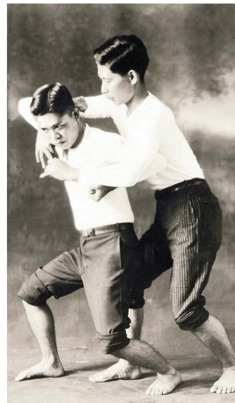
Hawaii Karate Museum

The Hawaii Karate Museum Collection contains a wide variety of