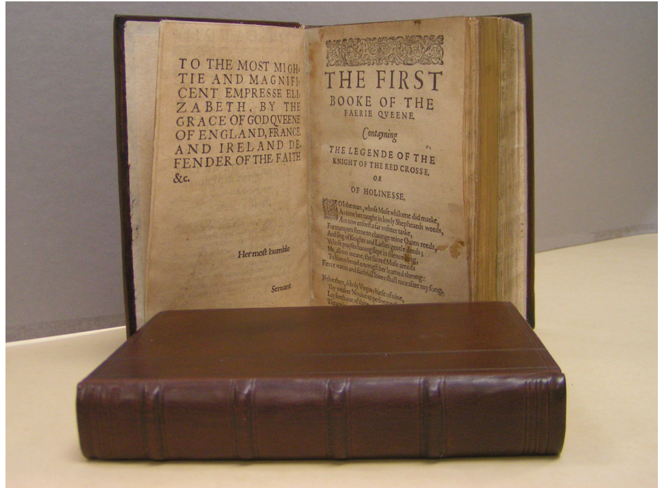
After treatment: The faerie queen with its full calf cover, decorated with blind embossing, typical of the late 16th century period.

Following the successful repurposing of spaces in Sinclair Library, we have embarked on planning for a major redesign of the Hamilton Library first floor. Our Preservation Dept. staff have been working with the Art Dept. Gallery on a major exhibit of 700 items from our John Carollo--Edward Gorey Collection to debut the end of September. And, we will have a major open house on August 22 to celebrate the return to the ground floor. Hope to see you there!