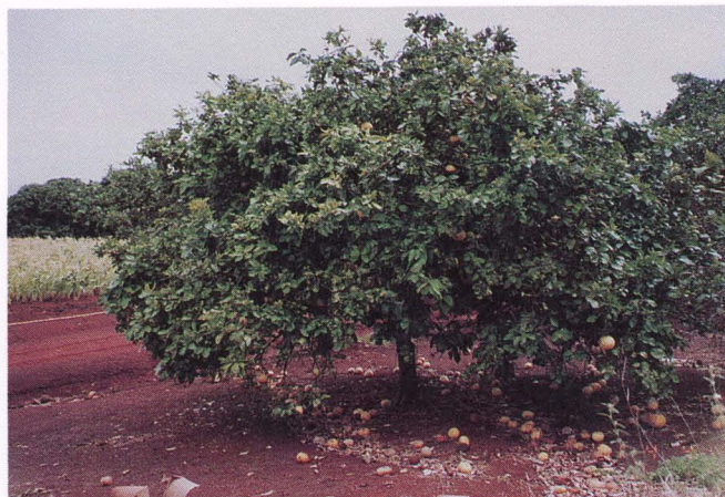
Fig. 1. 'Puma' tree.