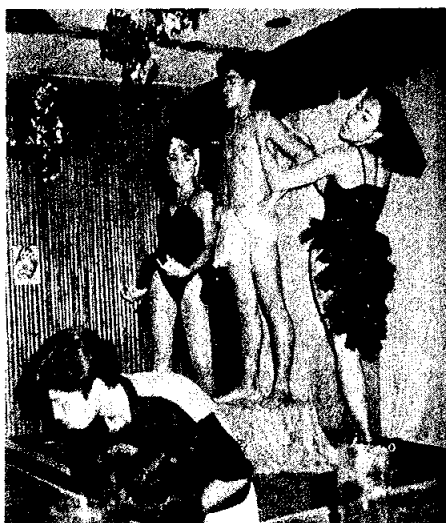
Nightclub floor shows such as the one shown here are one aspect of Thailand's large entertainment industry. Prostitution is an integral part of that industry, and sexual intercourse between prostitutes and male clients who do not use condoms is thought to be the main source of HIV transmission to the general population.

Corresponding numbers of male prostitutes are not known, although the Department of CDC estimated the number at 5,000 in 1988 and the rate of HIV infection to be higher among them: 1.28 percent versus 0.09 percent for female prostitutes (Thailand, Dept. of CDC, 1988:9,18). HIV prevalence among three types of prostitute have been reported for Chiang Mai Province as of December 1990: undisguised female prostitutes, 23.2 percent; disguised or "hidden" female prostitutes (those working in nightclubs, bars, escort services, massage parlors, and the like), 8.4 percent; and male prostitutes, 14.0 percent