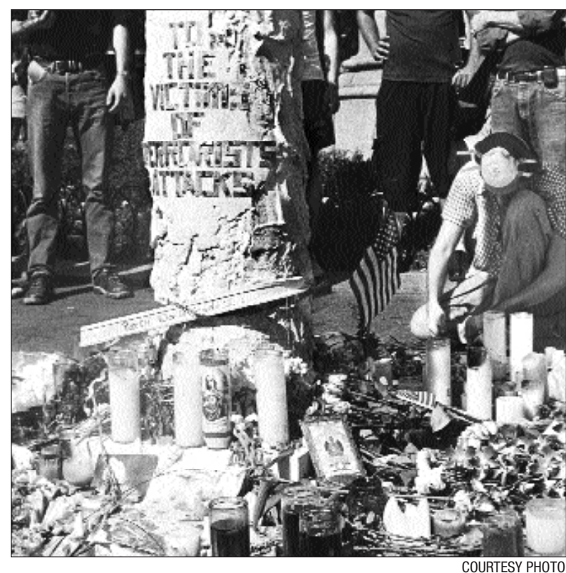
Tributes are left in Union Square for victims of the Sept. 11 terrorist attacks. Following the attacks, many flocked to religion and patriotism for support.

Right now, Darnall said, America is in a snooze period waiting for the buzzer to go off again.