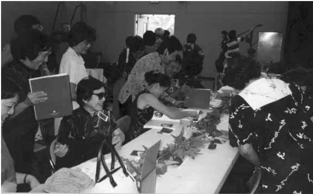
Booksigning by contributors for ACUW publication of Chinese Women Pioneers in Hawaii (2003), on January 19, 2003, at a community church.