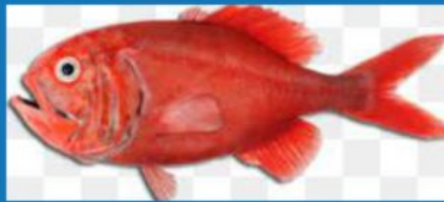
Orange Roughy (Endangered)

Today, one person eats on average 19.2kg of fish a year