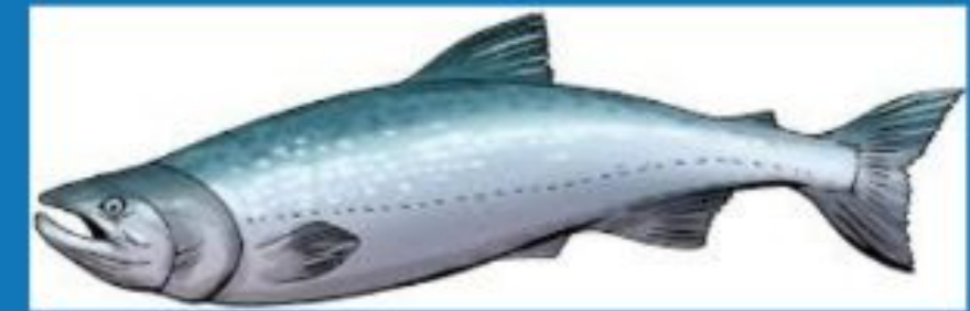
King Salmon (Endangered)

In 2013 93 million tonnes of fish were caught world-wide