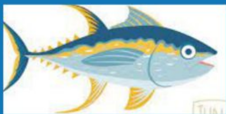
Yellowfin Tuna (Endangered)

The world's oceans will be emptied of fish by 2048