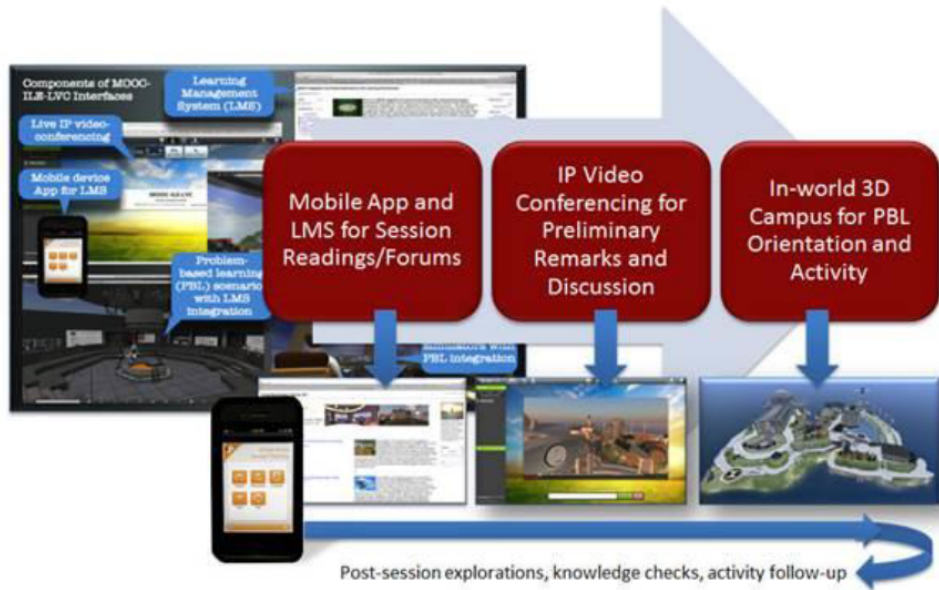
Figure 2. Facilitator Guide for the MOOC ILE weekly workshops