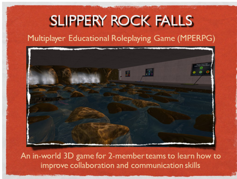
Figure 1. The starting area for the Slippery Rock Falls game.