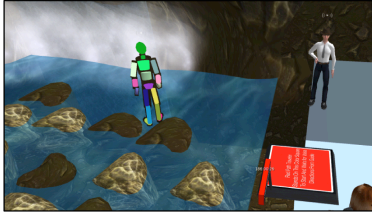
Figure 3. Playing the Slippery Rock Falls game

In each of the two-player teams, one player becomes the Guide and clicks on the Team Control Board (depicted in Figure 4) to obtain and wear a heads-up display (HUD) device that shows a map that depicts the path to cross the water. The second player is the Traveler. When the Start/pause button is clicked, the Traveler steps onto the rocks and seeks a safe path across the water by following the instructions provided by the Guide. As seen in Figure 3, the rocks are visible and seem deceptively easy to navigate. The challenge for the Guide stems from discovering how to communicate the path to the Traveler, who interprets the instructions to safely navigate the slippery rocks. In addition to communication and cooperation skills, the Traveler needs to respond with precise motor skills to accurately execute those instructions.