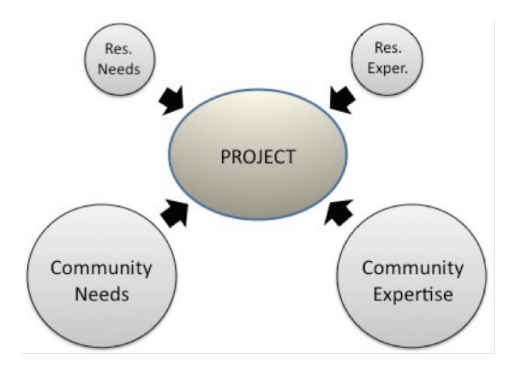
FIGURE 2. New-Age View of Community Collaboration in the Research Process.

Conversely, and likely at least partially in response to increasing criticism within academia about this traditional approach, there is a growing discourse in which ethical research is framed as only that which is dictated by community interests, with researchers playing a sort of consultant role (see discussion in Bowern 2008:§1.2.4). We have come to refer to this view as the "new-age" view (see Figure 2), because it responds to past and contemporary power imbalances by wholly embracing a view (often essentialist) of the needs and expertise of a marginalized group, while denying the needs and expertise of one's own communities of practice. As noted earlier, in the case of the researcher, these will often include theoretical interests and expectations of academic productivity. The new-age view is seemingly progressive, and may sometimes be necessary to address extreme power imbalances, but simply reversing traditional power structures is in itself no more collaborative than the model illustrated in Figure 1.