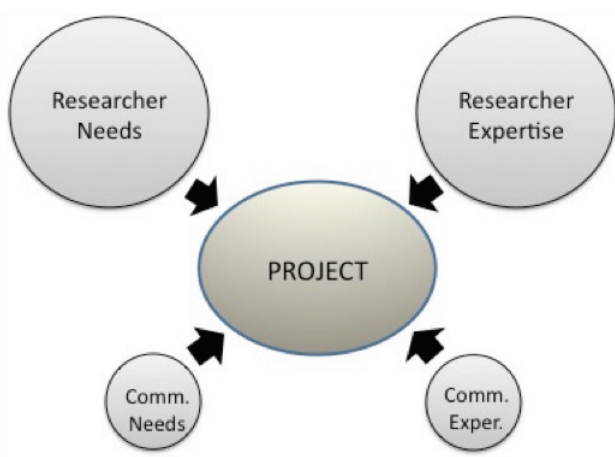
FIGURE 1. Traditional View of Community Collaboration in the Research Process.

program. This traditional view of pseudo-collaborative research is embodied in Czaykowska-Higgins's critique of the "Linguist-Focused Model" in which the linguist/researcher is "in a position of intellectual power with respect to the language-users" (2009:22). We illustrate a generic manifestation of this traditional view of community collaboration in Figure 1: