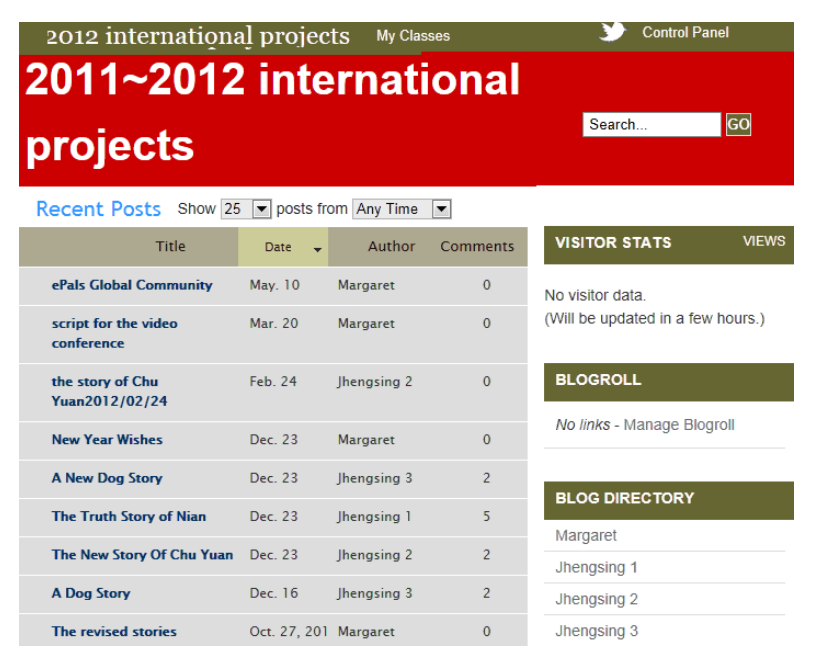
Figure 2. Screenshot of the class weblog

A class weblog (see Figure 2) was set up to facilitate teaching and learning in the course. The blog contained a collection of information and learning resources that gave step-by-step support to students as they completed their project tasks. Each group had its own individual blog within the class blog in which students wrote their project drafts and did peer-corrections. The researcher also answered students' questions and commented on students' work through the class weblog.