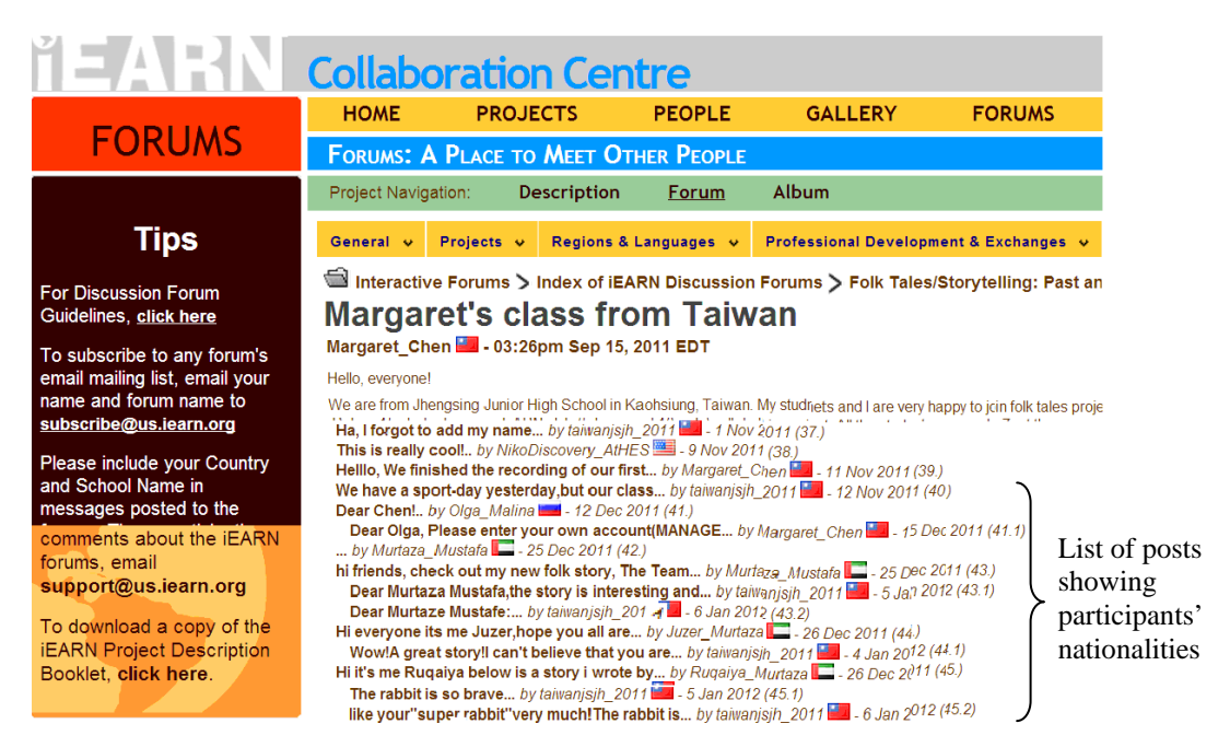
Figure 4. Screenshot of the folk tales project online forum