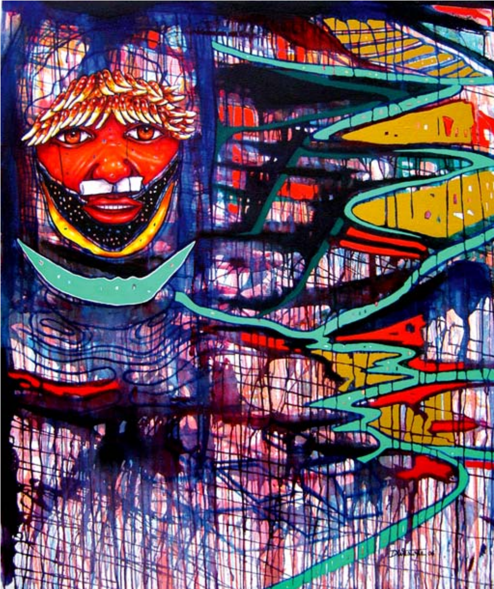
People and Their Environment , by Daniel Waswas Acrylic on canvas, 2006, 130 cm x 110 cm. From a private collection in Australia.