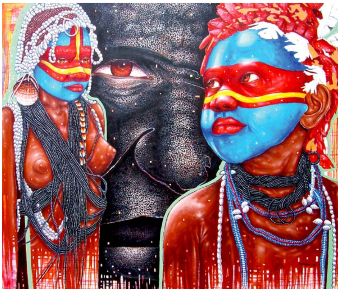
Journey to Womanhood , by Daniel Waswas Acrylic on canvas, 2006, 150 cm x 130 cm. From the Manukau City Council collection, Auckland, New Zealand.