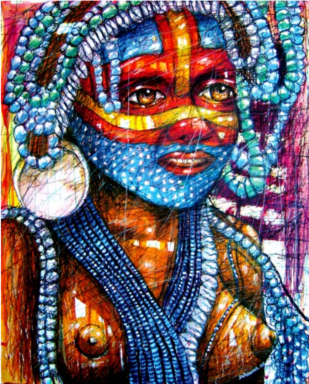
Elegance , by Daniel Waswas Oil pastels on paper, 2005, 80 cm x 60 cm. From a private collection in Papua New Guinea.