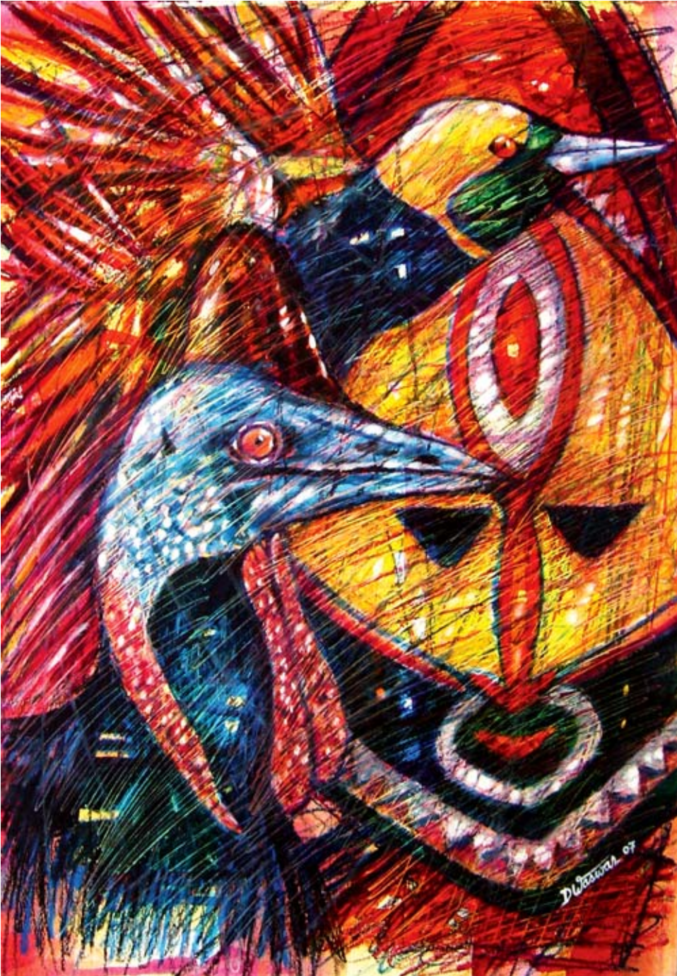
Essence of Culture and Environment , by Daniel Waswas Oil pastels on paper, 2007, 80 cm x 60 cm. From a private collection in New Caledonia.