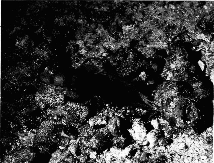
Figure 2. Alpheus randalli with host goby Amblyeleotris aurora , Male Atoll, Maldiv Islands, 36 m.