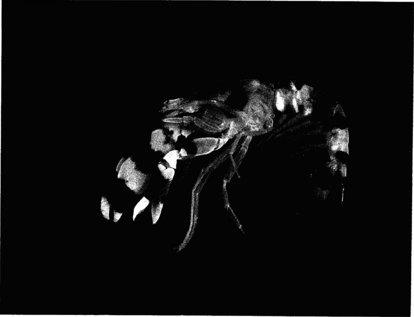
Figure 1. Holotype of Alpheus randalli , BPBM S8572, Nuku Hiva, Marquesas Islands.