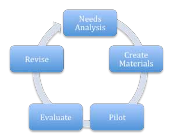
Figure 2. Process of material development.

My plan is to follow a cyclical model of material development (Figure 2). I will pilot a lesson among a small group of students, and they will be asked to give feedback on the materials and teaching approach. For materials evaluation, I will consult with the language coordinator and business specialist to make sure that students are appropriately challenged both linguistically and content-wise.