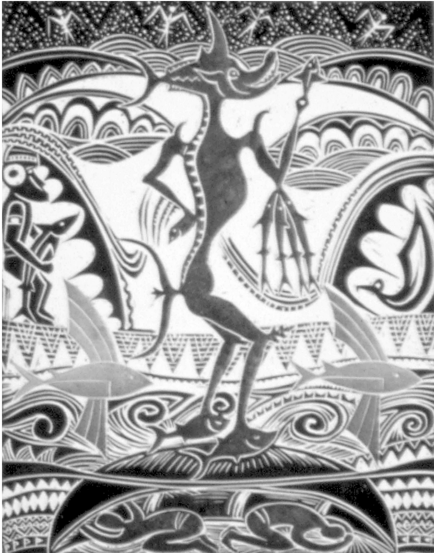
Spirit of the Sea Linoprint, 2002, 16.25" x 13"