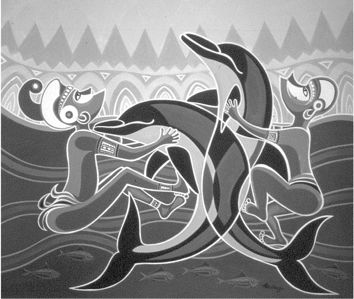
Friendlies at Sea Acrylic on paper, 2002, 19" x 20"