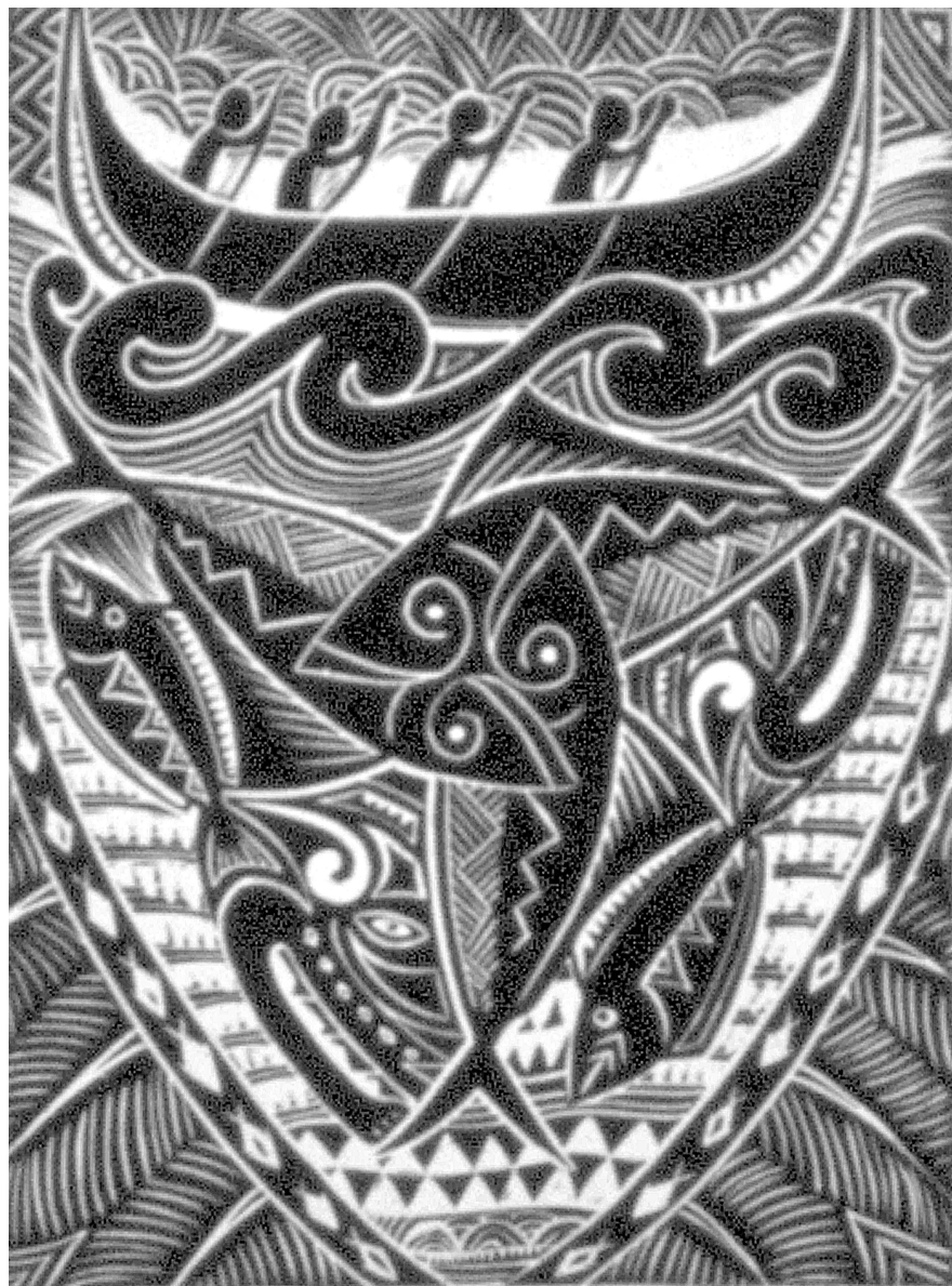
Fisherman's Trap Linoprint, 2002, 22.25" x 17.25"