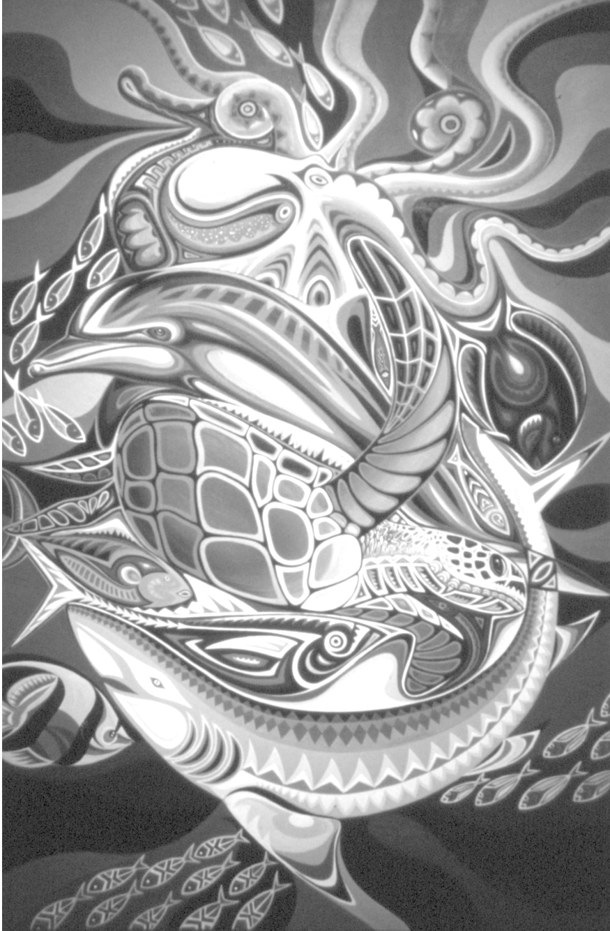
Circle of Survival Acrylic on canvas, 2002, 36" x 24"