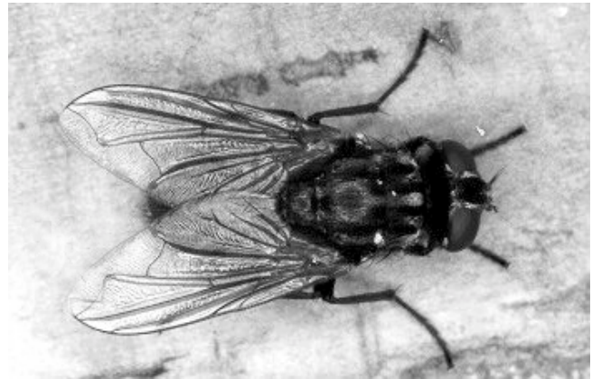
House fly adult

Homeowners and restaurants should remove garbage at least twice a week and keep the area clean.