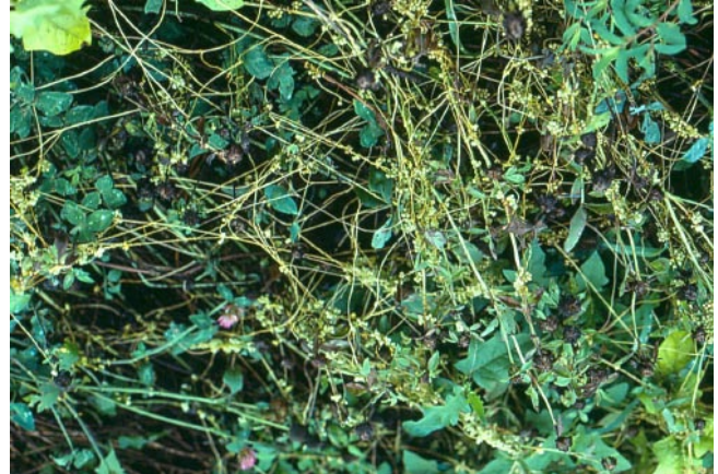
Cuscuta campestris on the legume white clover ( Trifolium repens ); both species are introduced to Hawai'i.