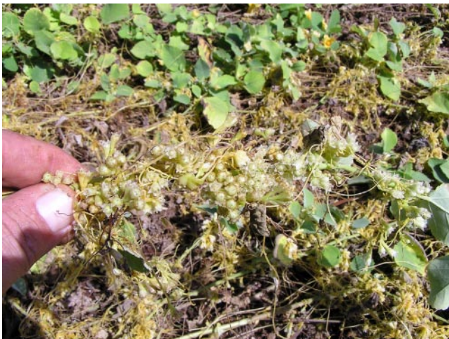
Cuscuta sandwichiana on 'ilima ( Sida falax ); both species are endemic to Hawai'i.