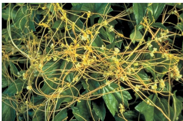
Flowers of Cuscuta species (dodders) occur in cymose to globose clusters; these plants tend to spread across and parasitize herbaceous plants at ground level.