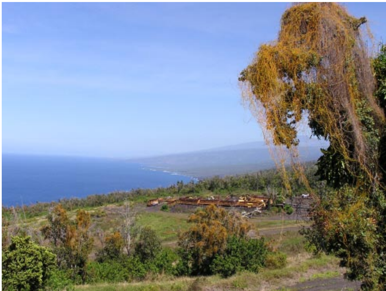
Cassytha filiformis is spreading along the roadways of the South Kona coast of the island of Hawai'i where lands have been bulldozed and developed. Here, C. filiformis is a parasite of 'ohi'a lehua ( Metrosideros polymorpha ) and other plants, creating an eyesore in landscapes.

tial human health applications. For instance, ocoteine, a compound isolated from C. filiformis , was found to be an alpha 1-adrenoceptor blocking agent in rat thoracic aorta. This type of chemistry has potential applications for inhibiting certain carcinomas such as prostate cancer. Octoeine and a number of other compounds in C. filiformis have antiplatelet aggregation activity.