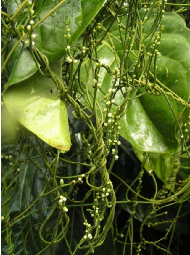
Twining habit of vine-like stems of Cassytha filiformis on noni ( Morinda citrifolia ); the genus name Cassytha derives from kesatha, Aramaic for “a tangled wisp of hair.”