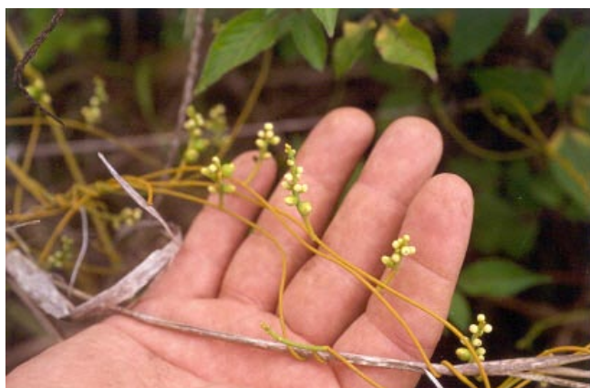
Flowers of Cassytha species (also known as “dodder laurels”) occur in spicate or racemose clusters; these plants tend to climb up and parasitize larger woody plants and shrubs.