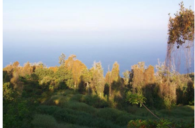
A severe infestation of Cassytha filiformis bridging several tree species, shrubs and surrounding vegetation on the South Kona coast of the island of Hawai‘i