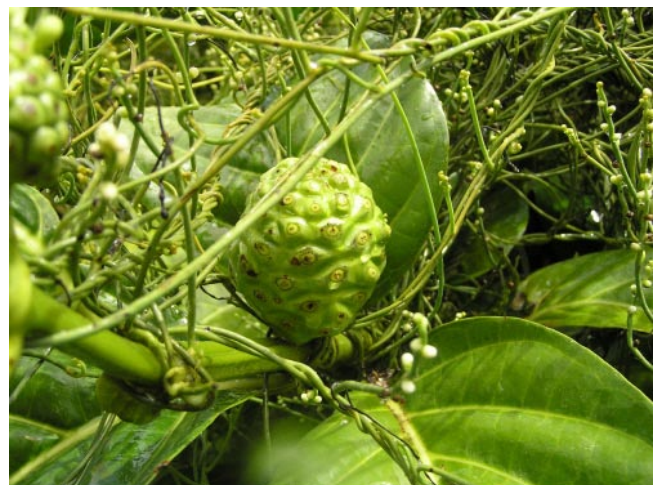
Cassytha filiformis on noni ( Morinda citrifolia ), in the coastal Puna district, island of Hawai'i

Photos: Unless noted otherwise, photos are by S. Nelson.