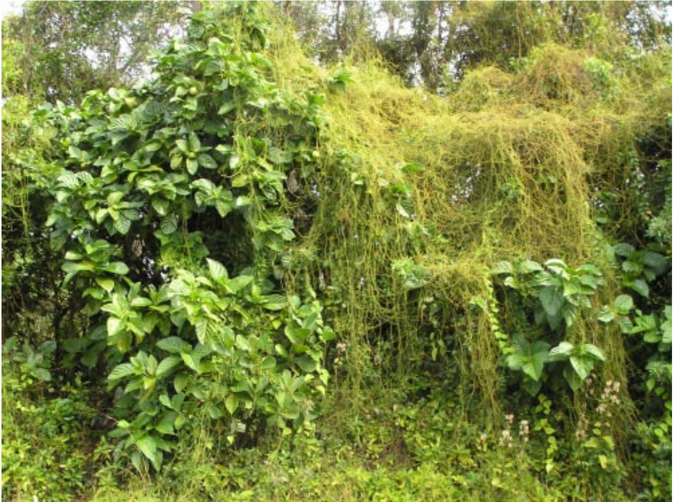
Cassytha filiformis enshrouding and bridging noni ( Morinda citrifolia ) plants in the coastal Puna district on the island of Hawai'i.

lular nutrients and water from plant phloem and xylem. Even though the haustorium is an intracellular structure, it is not in direct contact with the host cell cytoplasm. In the case of phloem tissues, the cells of the plant host and the pathogen are separated by their respective cell membranes. Nutrients and fluid pass through these membranes. After the haustorium directly penetrates the cell wall, the haustorium does not penetrate or break through the plasmalemma membrane, but rather invaginates it.