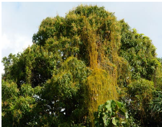
Cassytha filiformis on mango ( Mangifera indica ), Hilo International Airport

Human practices associated with the spread and increased severity of C. filiformis infestations include air travel ( C. filiformis is a common parasite around airports