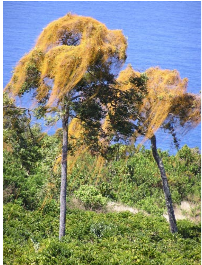
Cassytha filiformis on Metrosideros polymorpha ('ōhi'a) on the South Kona coast, island of Hawai'i

The two Cuscuta species in Hawai'i and C. filiformis are sometimes confused. In fact, they are all nowadays sometimes referred to by the same name in the Hawaiian language, kauna'oa. This fact calls into question the accuracy some of the reported host ranges found in the