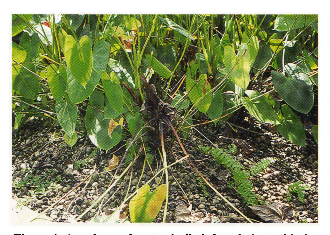
Figure 4. An advanced systemically infected plant with the growing point killed. Petioles often rot at the base and fall off prematurely.

Systemic or vascular infections usually appear first as a general yellowing of entire leaf blades of older leaves (Fig. 3). This is because the bacterium has become established in the vascular system; since water, mineral nutrients, and food cannot translocate to or from these leaves, they die. The petioles of these leaves and systemically infected flowers break off readily from the stem (Fig. 4). In some cultivars, the leaf and spathe petioles abscise or fall away from the stem so rapidly that the leaf blades may not turn yellow. The bases of these petioles have distinct brown spots (Fig. 5) when removed from the stem or thin brown lines or streaks when the petiole is cut lengthwise. This dark discoloration corresponds to the infected vascular bundles in the petiole and can also occur in the stem and leaf veins. Eventually, the leaf sheaths, the newly emerging leaf and flower buds, or the entire plant is killed.