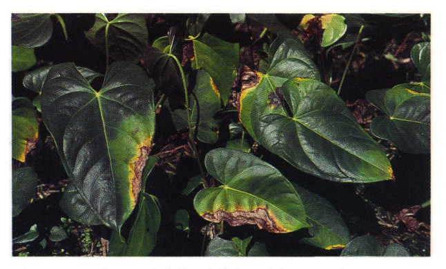
Figure 2. Advanced foliar blight with necrotic areas surrounded by a bright yellow margin. The spread of the bacterium in the leaf is characterized by a lighter, diffused yellow area.