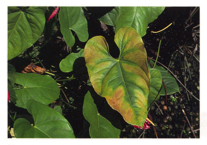
Figure 3. Yellowing of leaf on a systemically infected plant.