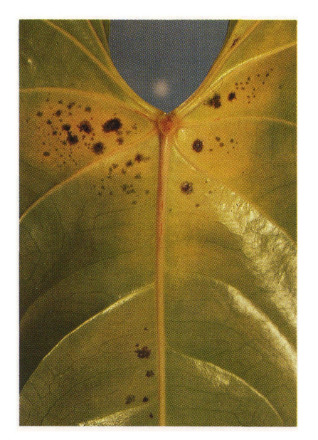
Figure 6. A young leaf with water-soaked and necrotic spots near the point of attachment and along major veins as a result of the bacterium moving up from the stem through the petiole and into the leaf.

stem into the leaf blade. In this case, watersoaked spots will occur near the main veins near the center of the leaf (Fig. 6). As the disease progresses, it will look very similar to foliar blight. Remember, however, that with foliar blight, the spots usually start at the leaf margins. Plants with systemic infection in the stem, petioles, leaves, and spathes have very high bacterial populations and usually die. If you determine that a plant has a systemic infection, remove the entire plant; do not try to save the plant by removing yellow leaves or systemically infected leaf blades.