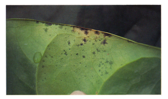
Figure 1. Characteristic early foliar blight symptoms. Water-soaked spots occur on the underside and along margins of leaves.

Foliar symptoms usually start at or close to the leaf margins on the underside of the leaf where stomata are most numerous. They usually begin as a slight yellowing with water-soaked spots that later become necrotic (Fig. 1). These watersoaked spots may not appear during dry weather, beginning instead as small brown spots. As the disease progresses, more leaf tissue is killed and the large, irregular, brown area is surrounded by a bright yellow border (Fig. 2). If the infected leaves are not removed, the bacterium will move down the petiole into the stem and will manifest itself in the systemic stage.