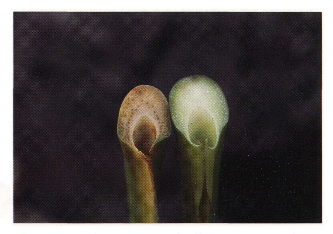
Figure 5. A rapid test to determine if plants are systemically infected. Break off a petiole from an older leaf with or without foliar symptoms and examine the petiole base or the leaf scar on the stem. Systemically infected petioles will break off easily and have numerous discolored vascular bundles (left); petiole from a healthy plant (right).

Systemic infection may sometimes resemble foliar infection. This occurs when the bacterium moves upward from the vascular system in the