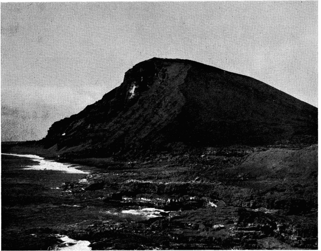
FIG. 2. Puu Hou, the littoral cone formed as the 1868 Mauna Loa flow entered the sea. Both photographs were taken from approximately the same point 38 years apart; above, June 14, 1924 (Stearns and Clark, 1930:7), below, by Moore and Ault, Feb. 1962.