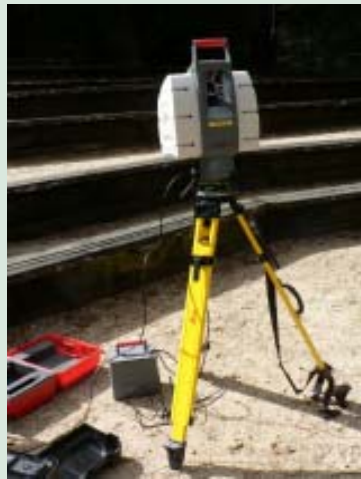
Ground-based LiDAR instrument

At each site, they are operating state-of-the-art instrumentation to measure the exchanges of water vapor, carbon dioxide, and energy between the forest and the atmosphere, and to observe the pathways of water entering the forest canopy as rainfall or fog interception. With the newly purchased LiDAR, the researchers will acquire high-resolution scans of each stand, over an area of 0.36 ha surrounding each tower. These data will be used to determine the following canopy structural parameters: canopy gap fraction, tree density, leaf area index, tree height, lower crown limit, basal area, canopy biomass, canopy area index, stem diameter, branch diameter, and branch inclination angle. This information is needed to set parameter values (canopy capacity, canopy cover fraction, trunk storage