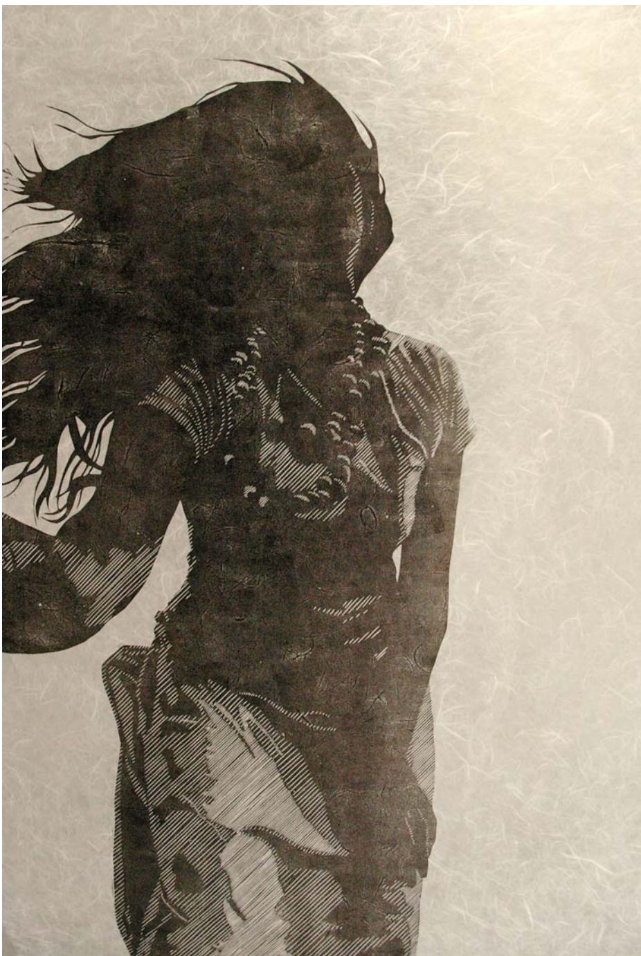
Sista Hihi , by Sue Pearson Woodcut, 2008, 38" x 25"