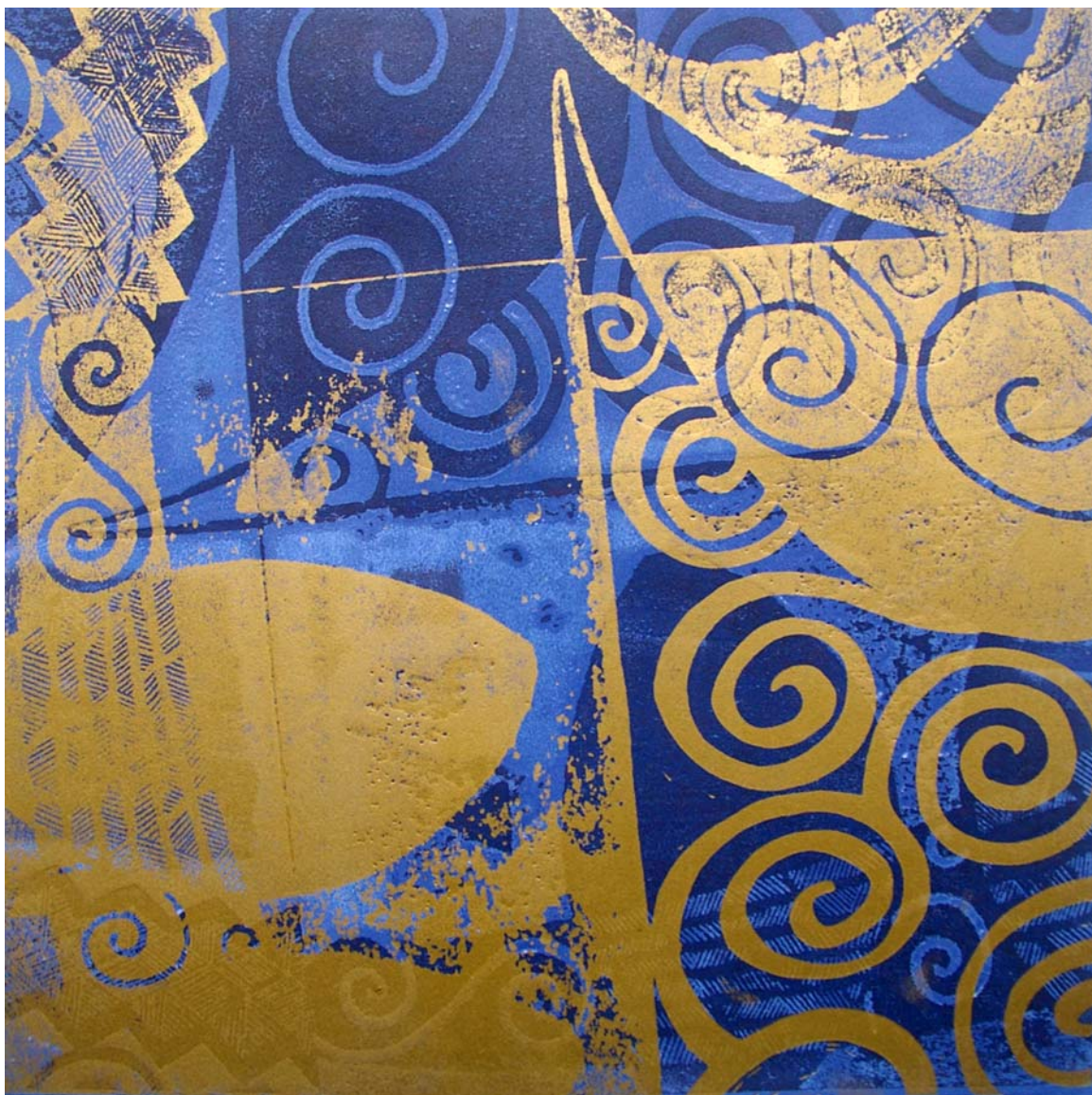
Va'a series AP 4 , by Sue Pearson Relief print, 2009, 16" x 16"