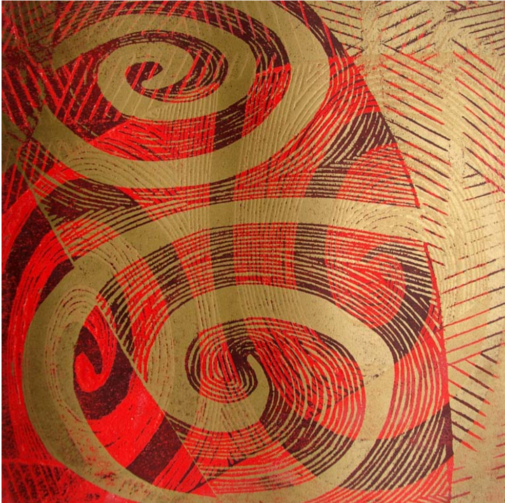
Va'a series AP 1 , by Sue Pearson Relief print, 2009, 16" x 16"