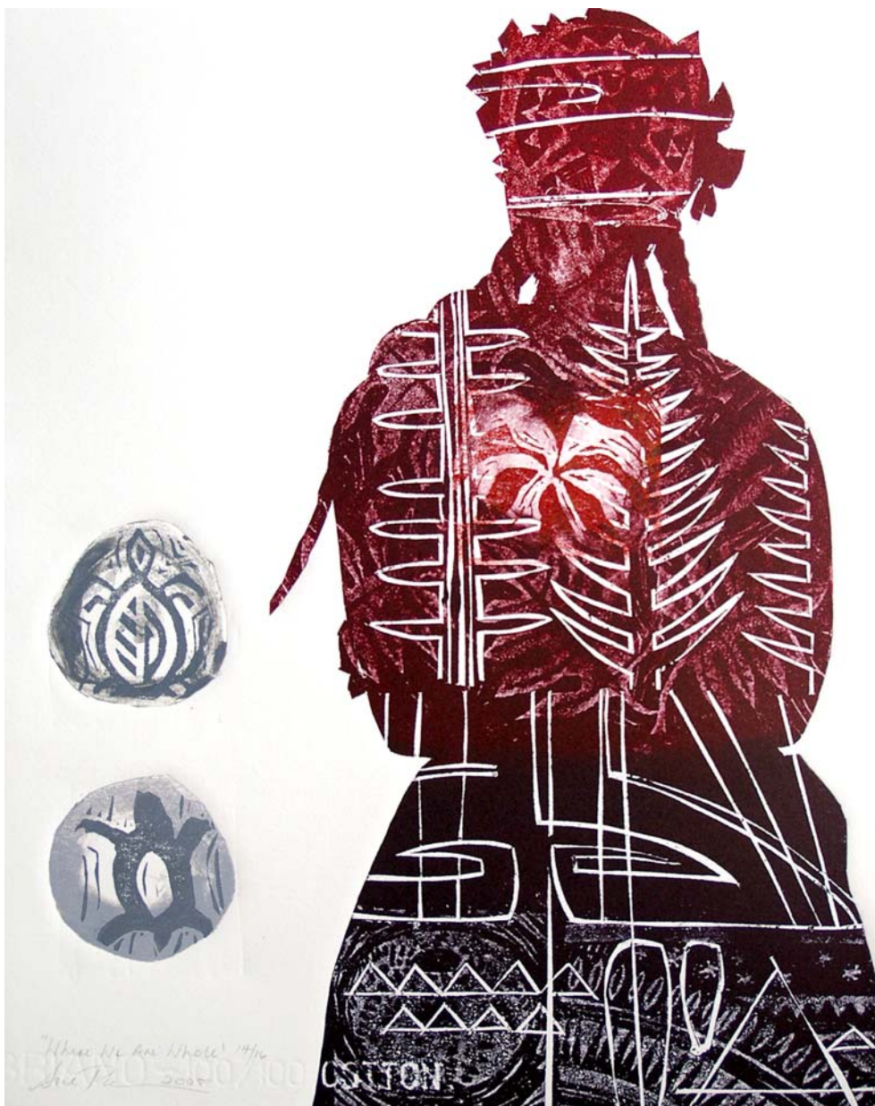
Where We Are Whole , by Sue Pearson Relief print, 2004, 14" x 11"