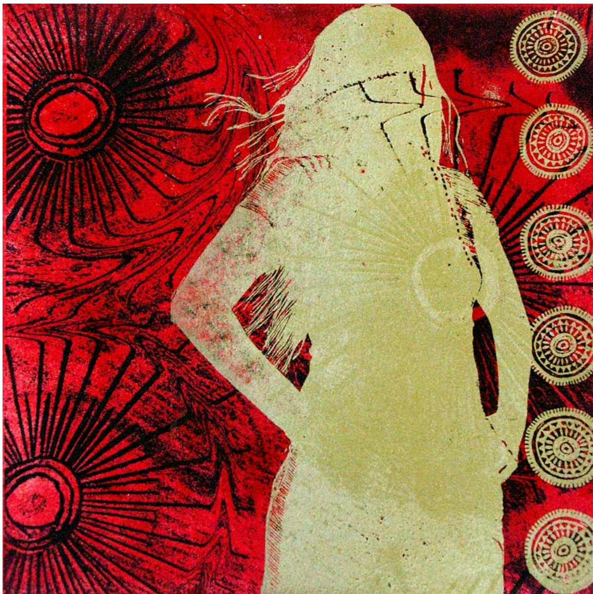
Aata III , by Sue Pearson Relief print, 2007, 7.5" x 7.5"