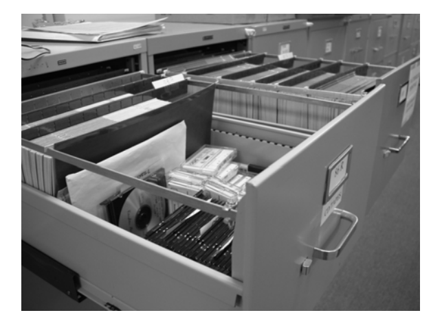
Figure 2. Test bank.