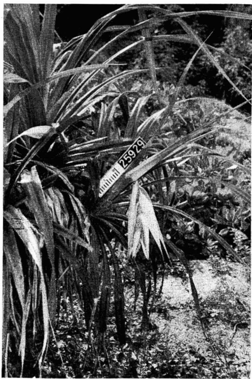
FIG. 45. Pandanus remotus , paratype, St. John 25,929, staminate plant with white inflorescence.

The new specific epithet is from the Latin, remotus , distant, in allusion to the widely separated phalanges of the syncarp.