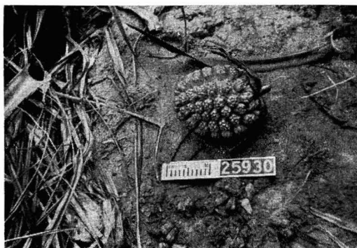
FIG. 44. Pandanus remotus , holotype, showing syncarp.

plane or gently curved, a little shiny, yellow with orange creases, drying brownish, the apex convex, the lateral carpal sutures shallow but distinct down to the middle, the central apical sutures 3–4 mm. deep, the lower half conspicuously enlarged and swollen with orange, juicy flesh, on the one drawn when fresh at the mid-section the upper part was 1.8 cm. in diameter while the fleshy lower part was 3 cm. in diameter, on drying the fleshy enlargement largely vanishes except for shoulders on each angle at the juncture and fleshy traces below that; pulp of the base very sweet and with a faint peach flavor but then with an irritating after taste; carpels 7–10, mostly 8–9, subequal, their apices conic-pyramidal, the upper \frac{1}{3} somewhat oblate, the marginal ones asymmetric and a little divergent; stigmas 1.5–2 mm. long, oval, creased, oblique, centripetal, below it the proximal suture extending \frac{1}{2} way to valley bottom; endocarp median, dark mahogany-colored, bony, that around the outer seeds 0.5–1.5 mm. thick; seeds 10 mm. long, 4 mm. in diameter, ellipsoid; upper mesocarp fibrous and cavernous between membranous cross partitions; lower mesocarp fleshy and very fibrous.