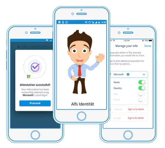
Figure 2. Mock-up of a decentralized IMS user interface