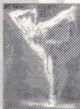
Basic Concepts in Modern Dance Gay Cheney $10.95