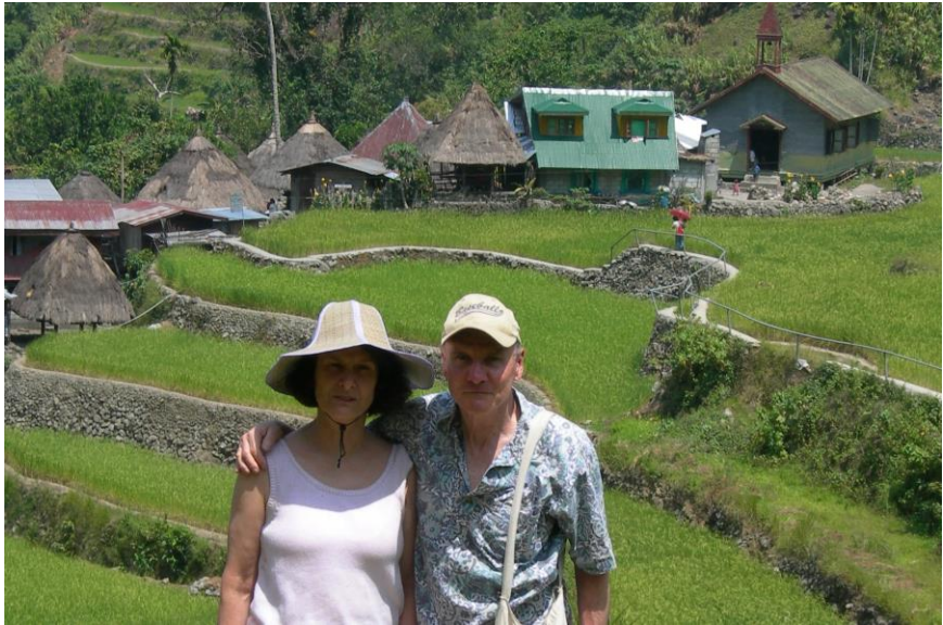
FIGURE 5 MY PARENTS AT THE WORLD HERITAGE SITE

Soon we reached a sleepy village with a few houses perched below us on the hillside and a bent, rusted sign that said “UNESCO World Heritage Site.”