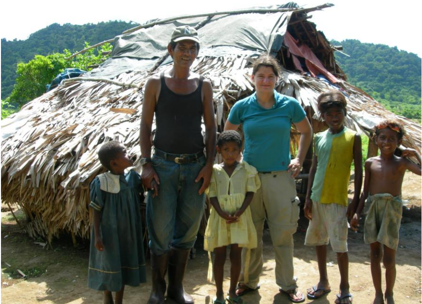
FIGURE 9 THE PHOTOGRAPH WITH THE TREASURE HUNTER