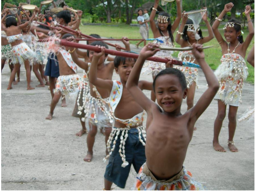
FIGURE 2 THE CHILDREN OF PALAUI PERFORMING A DANCE ROUTINE

parted and sat in a circle while a slim girl of about ten did a brief graceful solo performance until the drumming stopped. I applauded loudly.