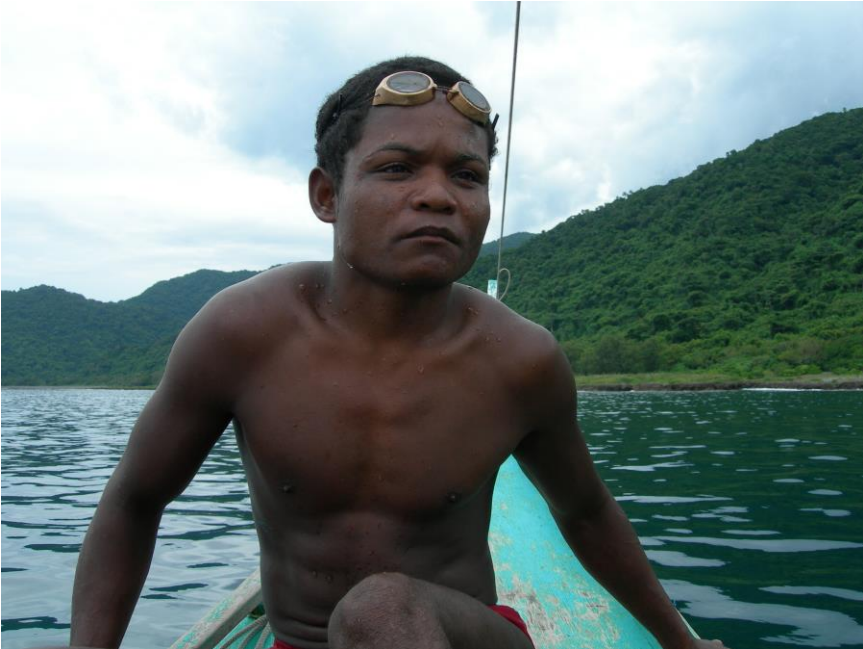
FIGURE 6 AN AGTA MAN WITH HOMEMADE FISHING GOGGLES