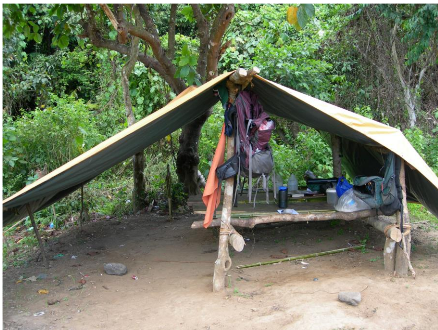
FIGURE 4 MY HUT WITH A TARP ROOF

Gregory began to hack away with his machete at the thick forest underbrush. The deadly knife had a worn wooden handle and a sharp blade that was 18 inches long and three inches wide. He swung it with skill and ease, and within minutes the bushes lay on the ground. Kanlab's wife swept the ground clear of the debris with a broom she had fashioned from the brush while the three men ventured deeper into the woods in search of a large tree appropriate for the main beam. They found one and began chopping it with their machetes, the chunking sound echoing through the heavy foliage. The tree fell with a loud whoosh, and the three bare-chested men emerged from the jungle with my rooftop tree on their shoulders. The pole was the perfect size. The screaming Agta children, as excited as I was, jumped from their new play structure to the ground and climbed back up to do it again. After Kanlab tested the frame for strength, the work was finished. All that remained was for me to buy a tarp for the roof.