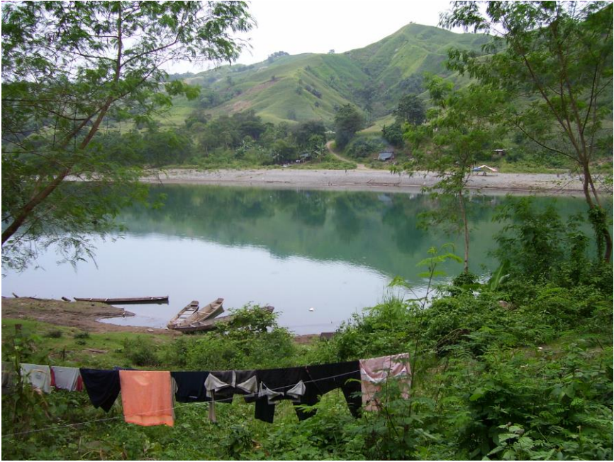
FIGURE 11 THE NAGTIPUNAN AGTA CAMP