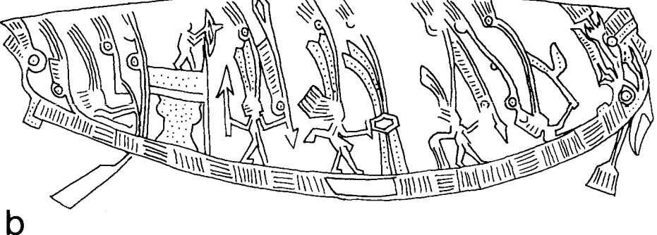
Fig. 1. Typical decoration on a tympanum (a) and side of a fully decorated drum (b). These examples of decoration are from a drum known as the Ngoc-lu drum, after Karlgren (1942: Pl. 4).