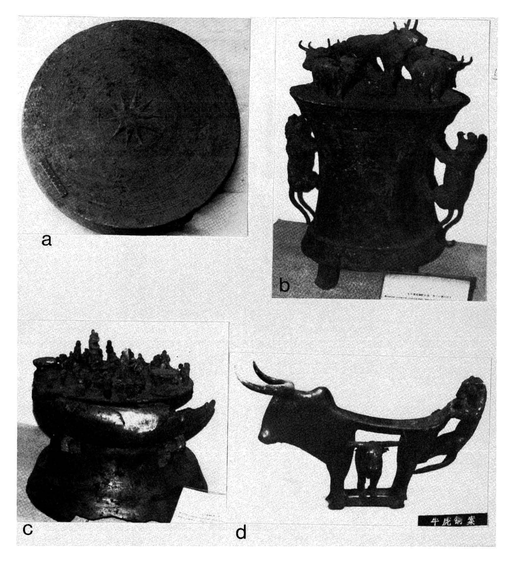
Pl. I. a , Typical tympanum of Dongson drum from Dong Son, in Than Hoa Museum, Viet Nam. b-d, bronze artifacts from Shizhai Shan, Yunnan: b-c, small drums with attached figures, and d , ceremonial pillow(?), all in the Yunnan Provincial Museum, Kunming, People's Republic of China.

1988). The art style was in place in northeastern Thailand by the end of the fourth millennium B.C. (White 1982).