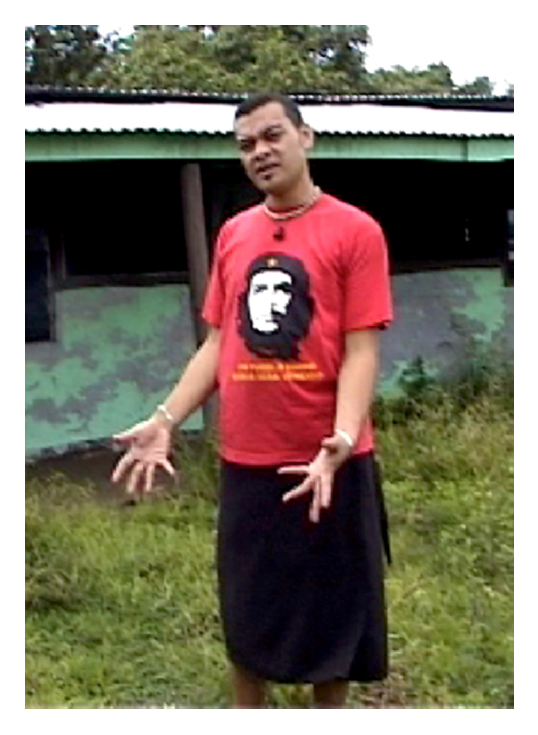
PHOTO 4. Pita reclaiming the sulu. Photo by author, 30 October 2002.

The symbolism that is part of these efforts to reclaim the sulu, to my mind, has an important political significance. By attempting to individualize the way in which the sulu is worn, I would argue that these activists were able to challenge mainstream conceptualizations of indigenous iden-