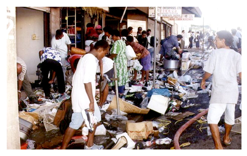
Рното 1. Looting Central Suva, 19 May 2000.

bilizing roles—for the most part, escaped retribution. While investigations into the activities of more than two hundred fifty rebel supporters began at this time, efforts focused primarily on identifying sympathizers within the military. In order to reduce tensions, the interim government emphasized reconciliation and national unity over retribution, moves that ultimately meant that aside from those more directly implicated in the coup leadership, the majority of those charged with lesser coup-related offenses received lenient treatment.<sup>13</sup>