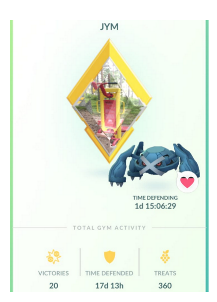
Figure 4. The word "jym" as it appears in an accepted portal turned into a gym in Pokémon GO.