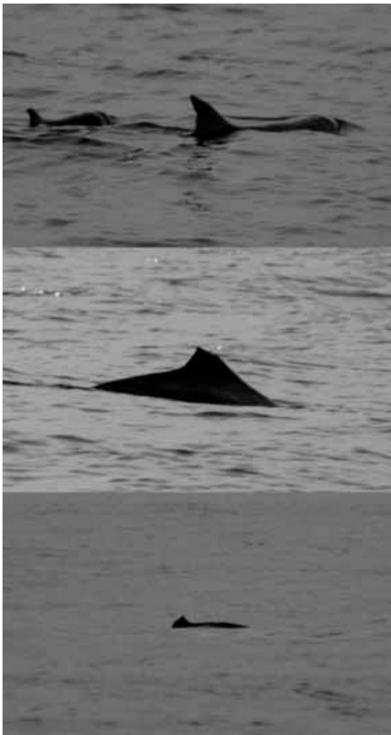
FIGURE 2. Dwarf sperm whales with distinctive dorsal fins ( top, middle ; top right individual with notch in middle of fin), photographed off the island of Hawai'i, 9 October 2003, and possible resighting (bottom) of one individual, photographed 20 October 2003.