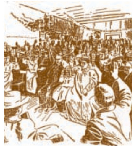
Meeting of Natives at Hilo, Hawaii, Thursday, September 16, 1897, to Protest Against Annexation.

In 2001, a partnership was formed to make primary documents from the late 19th and early 20th centuries concerning the overthrow of the Hawaiian Kingdom and the annexation of Hawai'i available via the Internet. Partners in the effort to contribute to the study of this significant period were the UH Mānoa Library's Hawaiian Collection, Desktop Network Services Department, and the UH Political Science Department. The Hawai'i Council for the Humanities and the Student Equity, Excellence and Diversity (SEED) Fund provided support. The project contributes to the recovery of a (continued on last page)