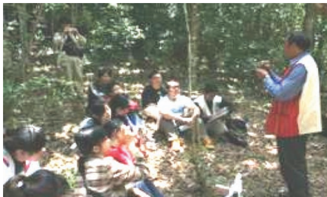
FIGURE 14: The Forest Lectures Led by Smangus Villagers

4.3 REFLECTION TIME INVOLVES GROUP DISCUSSIONS WITH THE PARTICIPATION OF VILLAGERS Group discussions are enjoyable and reflective, and often held in the forest. Before the two-day program ends, each group discusses the feelings and experience before and after the village visit as feedback to instructors and villagers. To encourage the students, the lecturers and teaching assistants from the village also share how they feel about the interaction during the two days. Figure 14 shows the lectures of villagers in the forest.