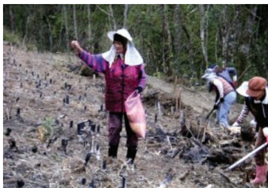
FIGURE 5. Millet Seeding

Tmubux : seeding. Whether the fields are seeded with millet on the next day is determined by a dream divination on the previous evening. Figure 5 shows villagers are seeding in the field. A dream of a river suggests a great millet harvest, whereas a bad dream tells some to seed on another day.