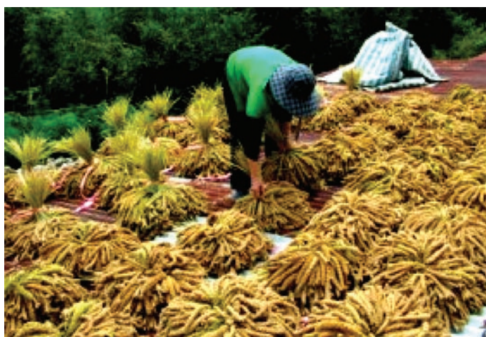
FIGURE 10: Millet Drying

“When the sun shines on the land, the harvested millet should be dried under the sun. Both sides of each tassel need to be dried for three days. Until millet are thoroughly dried, each tassel has to be rearranged.”