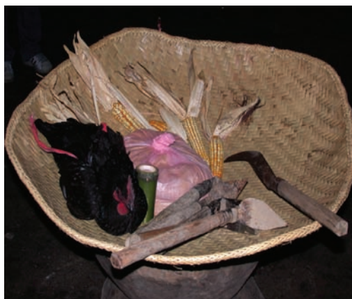
FIGURE 4. The Essential Elements for the Millet Ritual

Tmubux : seeding. Whether the fields are seeded with millet on the next day is determined by a dream divination on the previous evening. Figure 5 shows villagers are seeding in the field. A dream of a river suggests a great millet harvest, whereas a bad dream tells some to seed on another day.