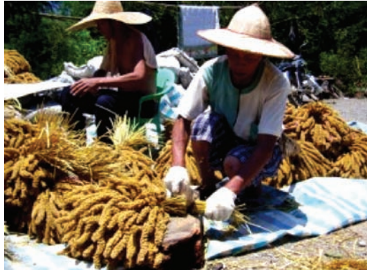
FIGURE 11. Millet Cleaning

“After that, we cut the superfluous stalks that cannot be trodden upon. If you tread upon them, you will get a malignant boil.”