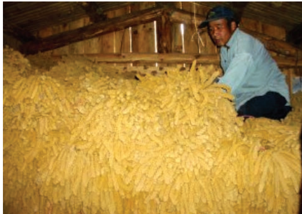
FIGURE 12: Millet Storage

“After drying and cleaning the millet, we store the stalks in bundles in the barn, and will call the production work finished.”