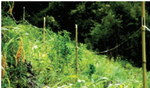
FIGURE 8. The Device to Repel Birds

“Before the millet tassels, we need to set up devices that repel birds around the fields and have people guard the fields so that the birds will not come and eat our crops.”