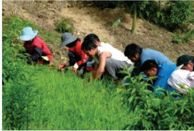
FIGURE 6. Weeding

“When each millet plant grows five leaves, it is time to weed. Weeding helps make room for the plants to grow strong and tall in an adequate space and brings an abundant harvest.”