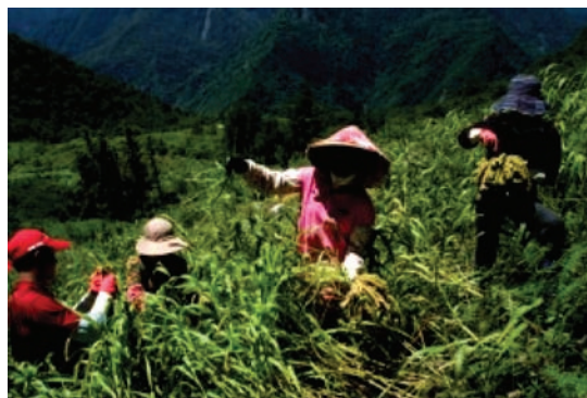
FIGURE 9. Millet Harvesting