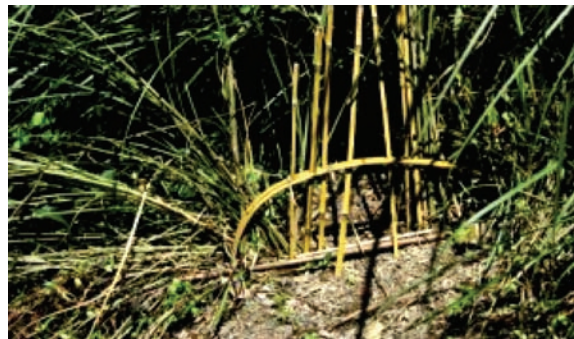
FIGURE 7. The Trap to Catch Rats That Might Eat Millet

“When the millet begins to tassel, we know the reaping season is coming soon. To prevent animals such as Red-bellied Squirrels, the Formosan Striped Squirrel, Spinou Country Rat, and others from eating the millet, we set up traps around the millet fields.”