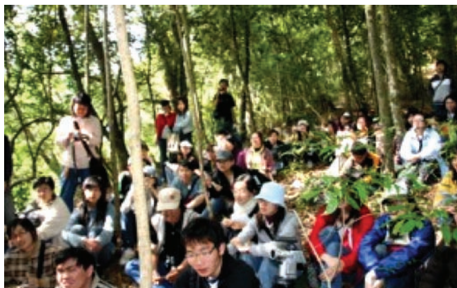
4.2 THE WALK IN KORAW ECO-PARK FOREST TRAIL. The activity includes: FIGURE 13: Students' Reflection Time in the Forest

the ethno-ecological interpretation along the crest line and the trail, the story of the lhyux na bnkis (ancestral cave), traditional hunting culture such as demonstrating how to set up traps, use fire and cook food. Finally, Figure 13 shows that a group discussion in the forest is a very critical time for reflection of students and the villagers.