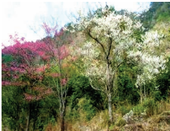
FIGURE 3. Cherry Blossom as an Indicator of Beginning of Growing Millet

The sign for starting growing millet. Tribes and villages vary; take the upstream village of Llyung Papak (the watershed of Papak ) as an example. Village inhabitants usually use the time at which the cherry trees in Tanan Sayun (a place name) blossom as the time for the millet seeding ceremony. Figure 3 shows that the sight of red and white buds signals the start of the millet-seeding season, which ends when the cherry blossoms fall. According to the elders, if seeded after the cherry blossoms fall, the millet harvest would be poor due to fierce storms.